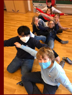
Photo: Jesus Friends at the Christmas service