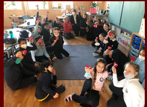
Photo: Story and SmartBoard

Then the class looked at the SmartBoard to see where Mozambique is located and immediately looked at the points of the compass to understand what southeast means.